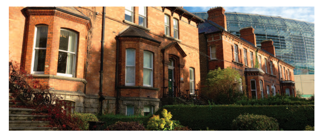
The SCSI would like to acknowledge the contributions of the Properties & Facilities Management Professional Group, Cluid Housing Association and Baker Tilly Ryan Glennon.

• Establishing a central point of contact in government to lead ongoing engagement with all stakeholders to ensure that key issues are considered and addressed for the benefits of tenants, landlords, professional agents and all stakeholders in the public interest